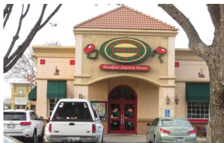
Our first outing at the Dancing Tomato

Our February Meeting was cancelled, so we had to do some catching up at the March Meeting. The 2 Bits Café was not available for this meeting, so we ended up at the Dancing Tomato. Nice place, but a bit small for our group. Several got to stand and watch.