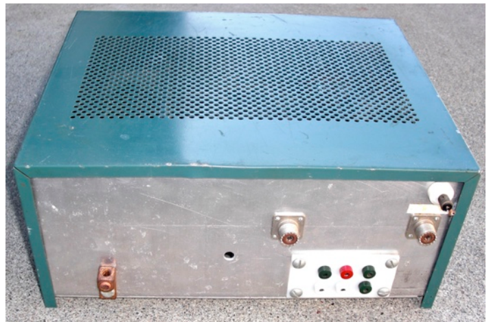
Rear Panel View