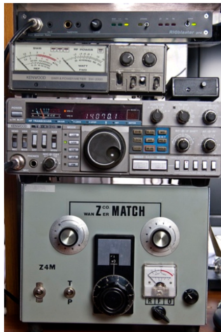
Russell, KB6YAF's PSK31 Station