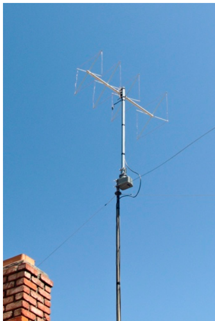
Eleanor's new 2m Quad