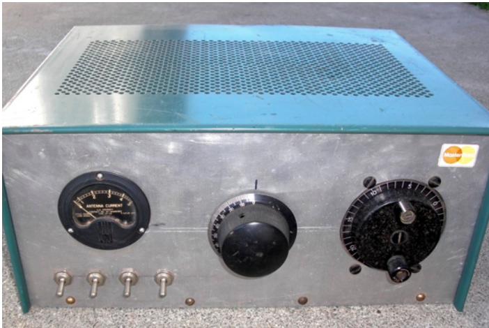
Front Panel View